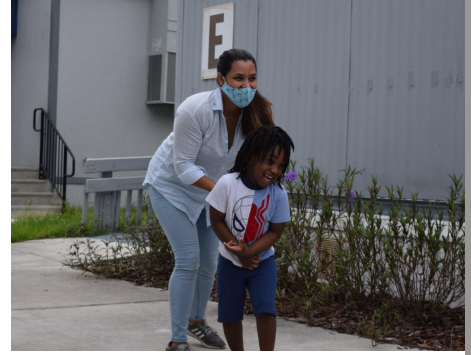
Outside activities and breaks