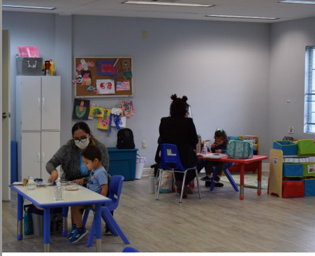
6-foot social distancing DTT areas